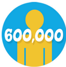
people in the UK with Epilepsy

in the UK will develop epilepsy in their lifetime.